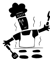
John Beardsley Bar & Restaurant Chair