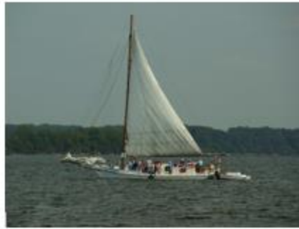
Skipjack Martha Lewis – Restoration Project – Volunteers Needed