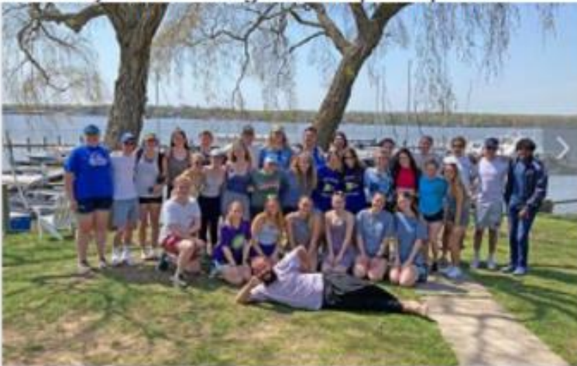
The 2021/22 UD Sailing Team

The University of Delaware Sailing Team hosted a successful regatta at NERYC April 23/24. Spring finally showed up with pleasant temperatures, and with it a sense of normalcy. Nine college teams participated.